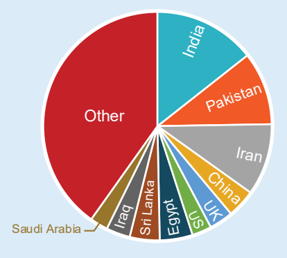
Immigrants to Canada – 10 top countries